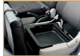
Front Passenger Under Seat Tray