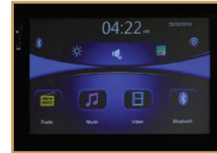
Infotainment System 9" Mp5 Touch Screen