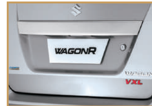
Rear End Chrome Garnish