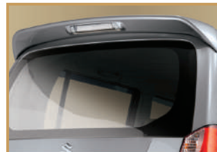
Rear Upper Spoiler