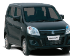
Super Pearl Black