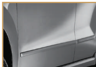
Side Body Moulding & Side Under Spoiler

The extremely practical Suzuki WagonR is loaded with an array of impressive accessories.