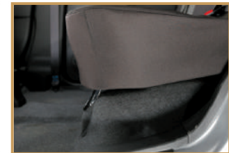
Rear Flat Floor