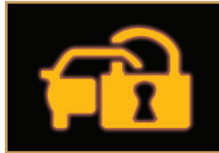
Immobilizer, Anti-Theft Security System