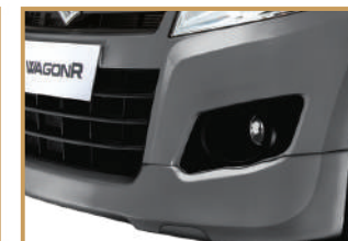
Front Under Spoiler