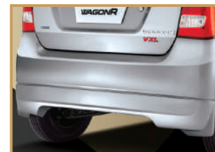
Rear Under Spoiler